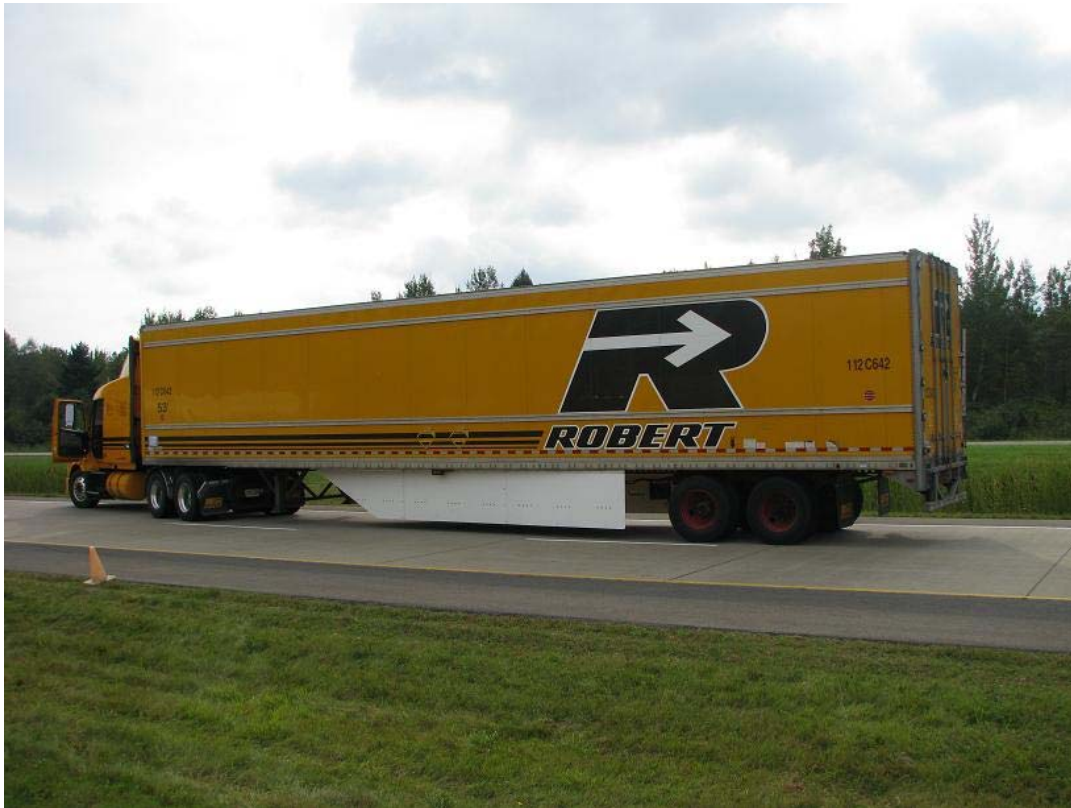
Figure 5. The tested technology: prototype no. 3.