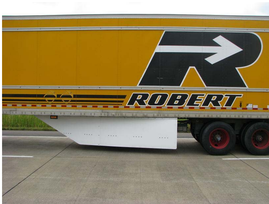
Figure 3. The tested technology: prototype no. 1.