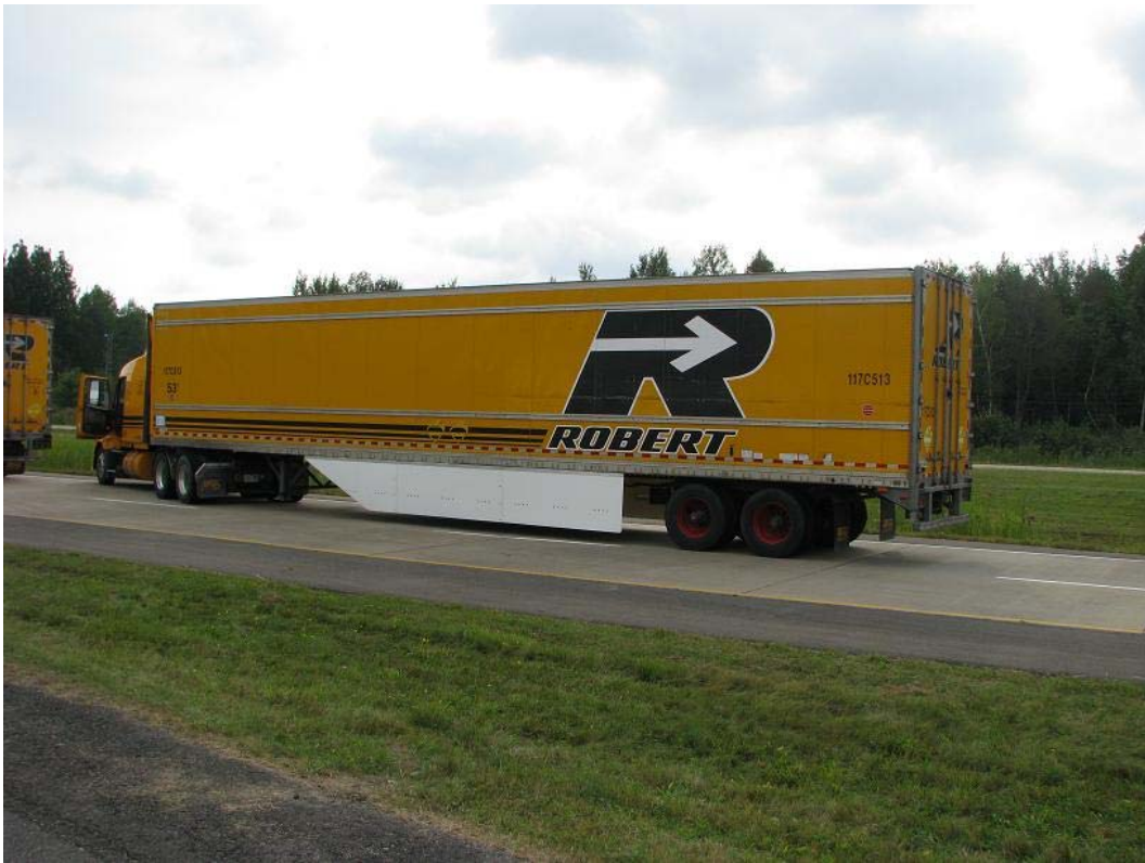
Figure 4. The tested technology: prototype no. 2.