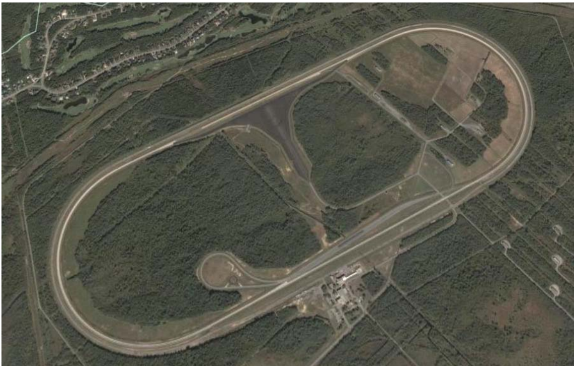
Figure 1. Aerial view of the Blainville test site.

The Energotest 2008 project took place from 2 to 12 September 2008 at Transport Canada's Motor Vehicle Test Centre (MVTC) in Blainville (Quebec), which is currently operated by PMG Technologies. The fuel-consumption tests were performed on the high-speed test track (BRAVO). This track is a high-banked, parabolic oval with a length of 6.4 km (4 miles). The length of a test run was 15 laps (almost 100 km), with departure and arrival at the same position along the track. Figure 1 shows the test site.