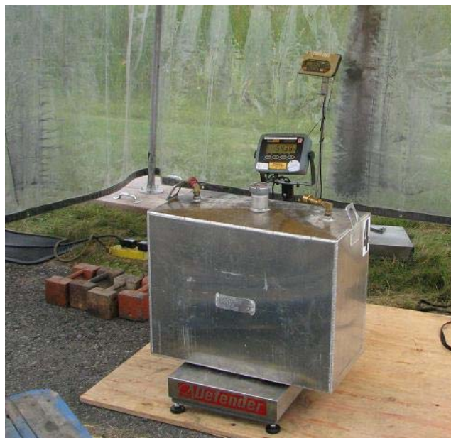
Figure 2. Installation and weighing of the temporary fuel tank.