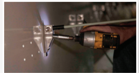
Simple and easy installation