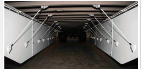
Pressure responsive support rod system