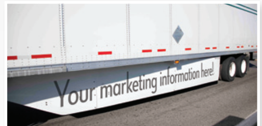
Graphics can be printed on the AeroFlex 2012